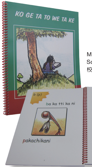
Meskwaki Settlement School (美斯夸基民族學 校) 的族語課本。

During the long nights especially during the cold winter months, families would talk in their language and tell stories of Meskwaki cultural heroes and mythologies of the spirit world - they would talk for hours before