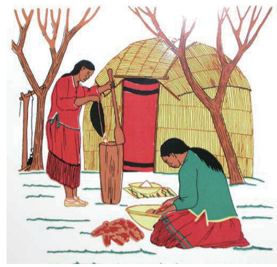
繪畫作品:美斯夸基族的婦女。